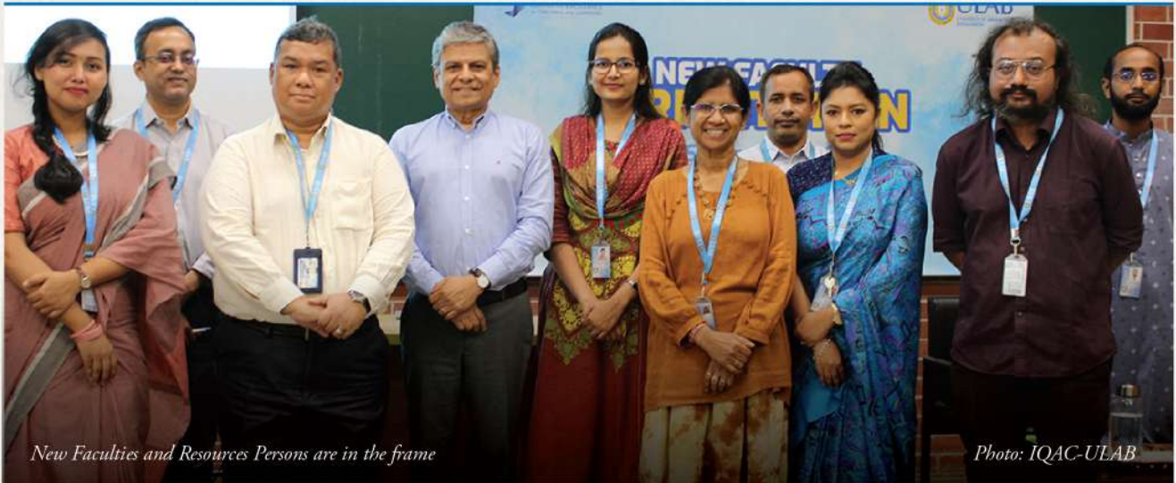
New Faculties and Resources Persons are in the frame