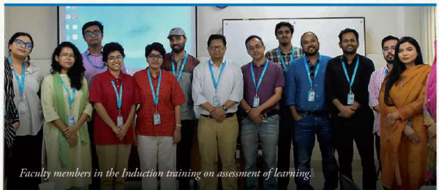
Faculty members in the Induction training on assessment of learning.