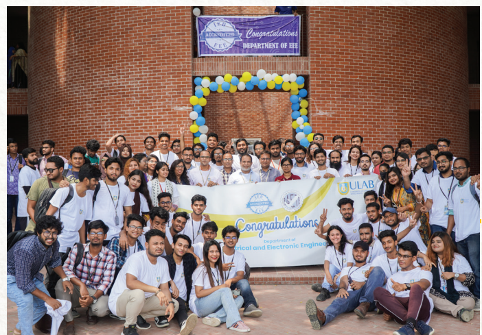
Caption: EEE celebrates IEB Accreditation

The celebration began with a cake-cutting ceremony, followed by a delightful celebratory walk with faculty members, students, and alumni joining hands in camaraderie, signifying the collective journey towards excellence. Throughout the event, memorable photos were taken, capturing the pride and joy experienced by all in attendance. ULAB extends its gratitude to BAETE and IEB for their recognition and trust in the EEE department. The university also expresses sincere appreciation to the dedicated faculty members, students, alumni, and the entire ULAB community for their unwavering support and commitment. This accreditation is a shared success that reinforces ULAB's position as a center of academic excellence in engineering education. It reflects the continuous efforts to provide students with an outstanding learning experience and equip them with the skills necessary to excel in their professional careers.