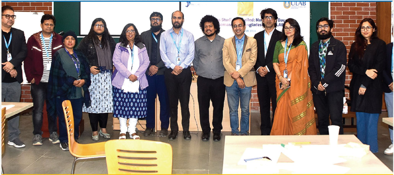
Faculties and Students at the Futures Studies Seminar.