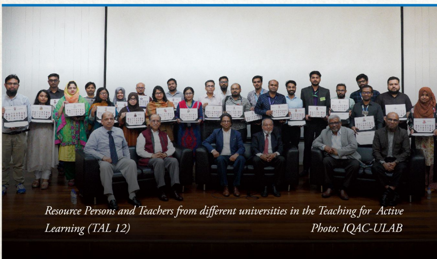
Resource Persons and Teachers from different universities in the Teaching for Active Learning (TAL 12)