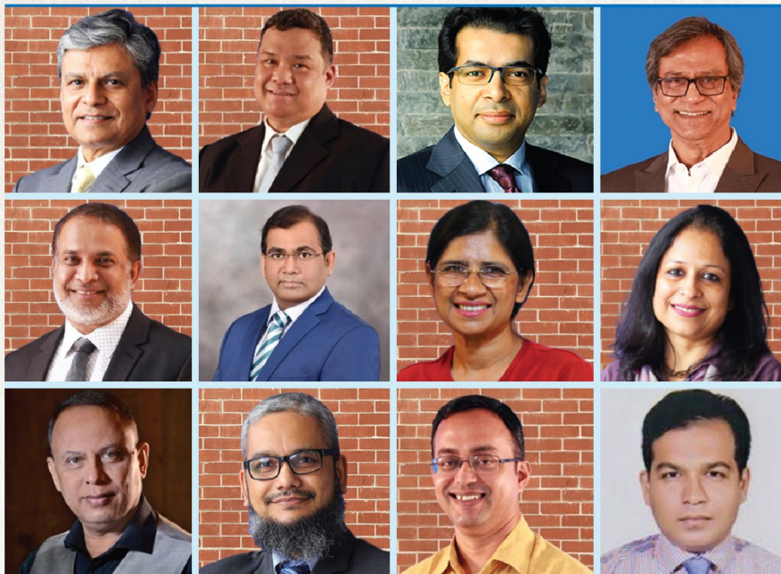
ULAB Quality Assurance Committee